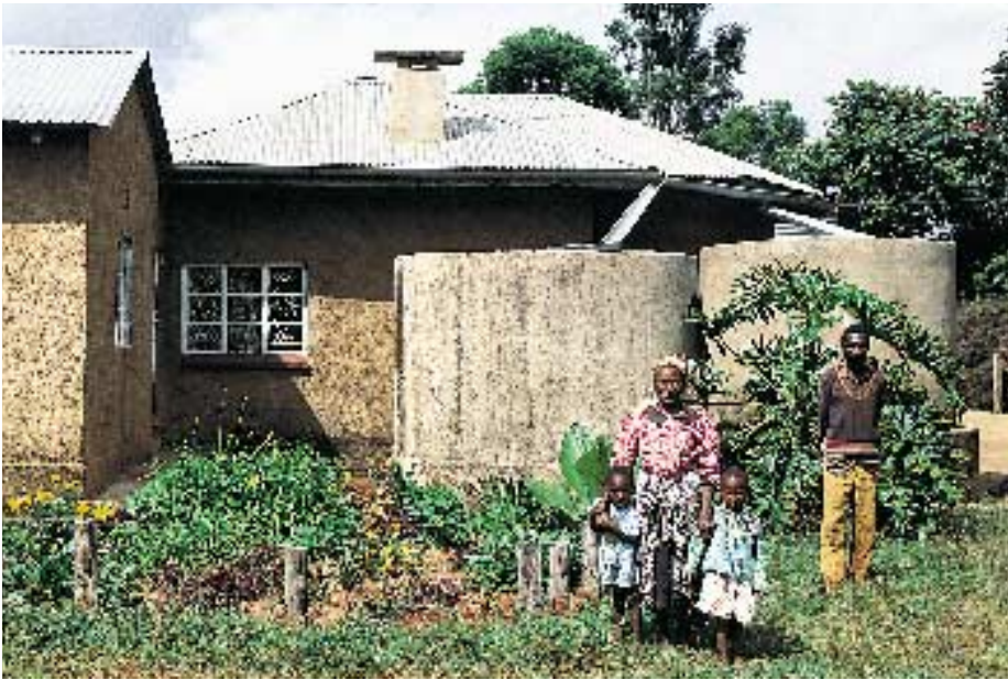
In Kenya, rainwater is harvested from roofs and stored in tanks, a simple technical solution that can help solve water quality and quantity problems, and reduce time needed to fetch water.