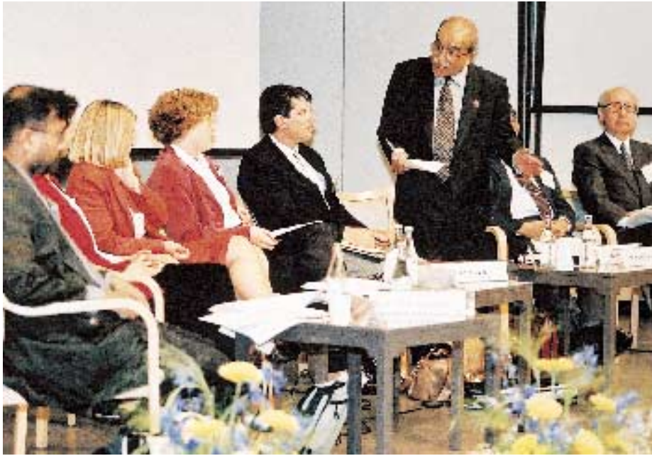
Former Stockholm Water Prize Laureates discussed water issues with their younger counterparts during the 2000 Stockholm Water Symposium. Such dialogue-building between a variety of water actors will be the key focus at the 2001 Symposium.

Dialogue and compromise building between different interest groups were key themes during the 2000 Stockholm Water Symposium's workshops, which are summarized in this Stockholm Water Front beginning on page 2. As components to building water security in the new millennium, the two themes will be an integral part of the 2001 Stockholm Water Symposium, "Water Security for the 21st Century – Building Bridges Through Dialogue," which takes place August 13-16, 2001, during the World Water Week in Stockholm.