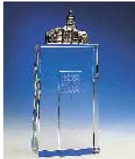
The winner of the 2001 Stockholm Water Prize will be announced March 22, 2001.

His Majesty King Carl XVI Gustaf of Sweden is the patron of the Stockholm Water Prize and will present the award at a ceremony in the Stockholm City Hall on August 16, 2001. ■