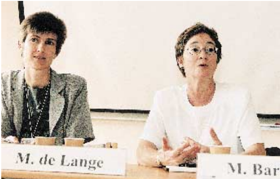
Women have two main appearances in relation to water management: as professionals in water resources management, and as users and custodians of groups of users and stakeholders.