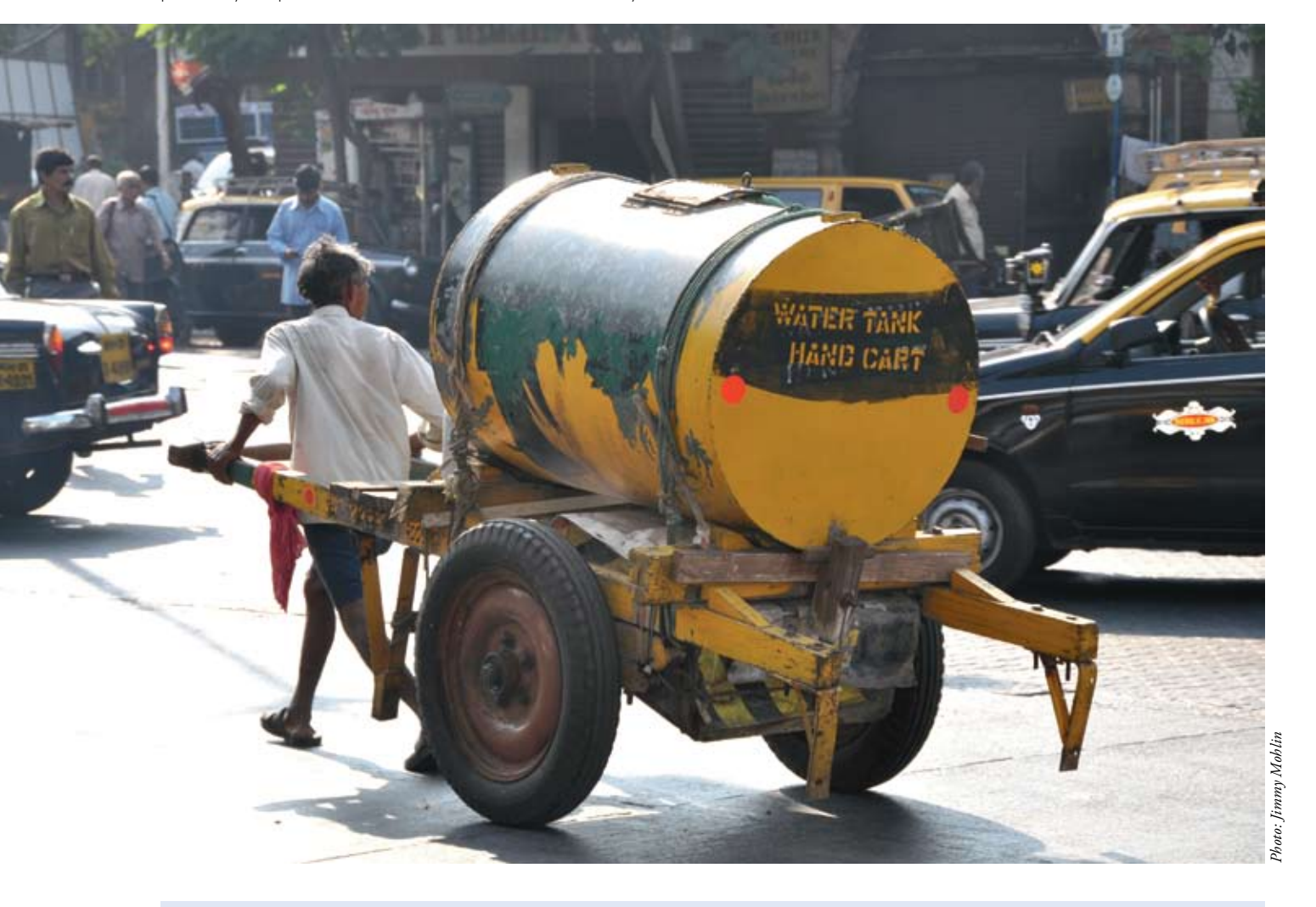
Box 1: Definitions of "sufficient, safe, acceptable, physically accessible and affordable water".

comparison, agriculture and industry accounts for a combined 90 per cent of human water use (UNESCO, 2009, p 99). However, ultimately the state of the ecosystems replenishing and purifying the planet's water will also determine our possibilities for realising the right to water. In the long run, protecting the right to water for future generations requires sustainable water resources.