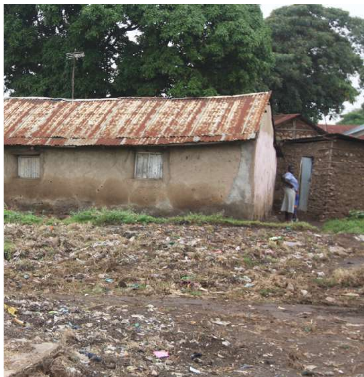
The dangerous water is a common topic among residents here.