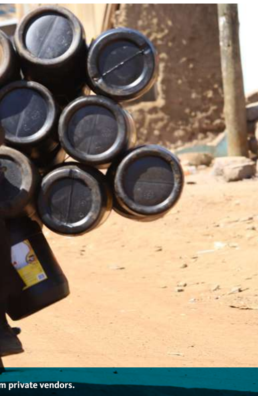
m private vendors.