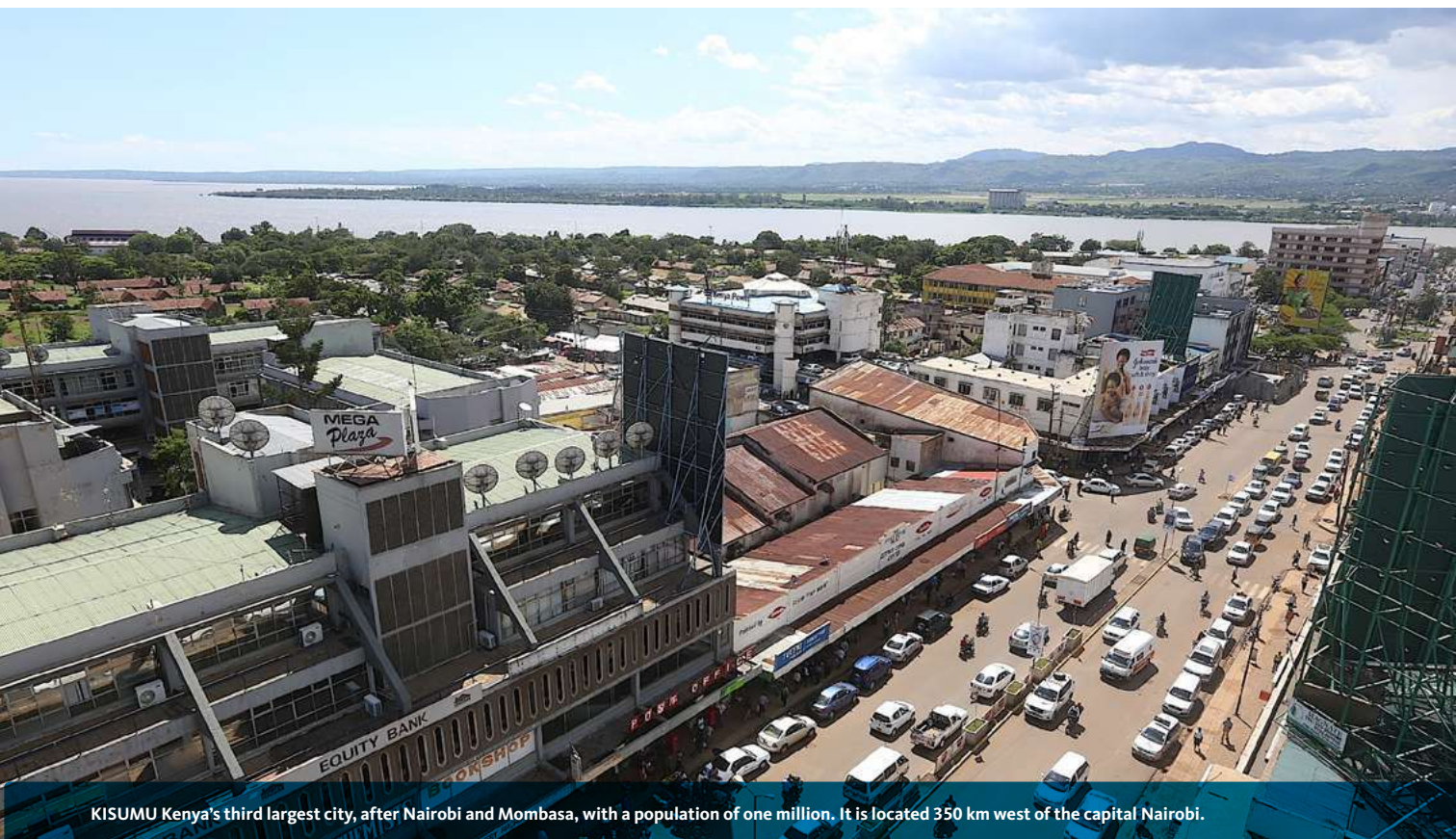
KISUMU Kenya's third largest city, after Nairobi and Mombasa, with a population of one million. It is located 350 km west of the capital Nairobi.